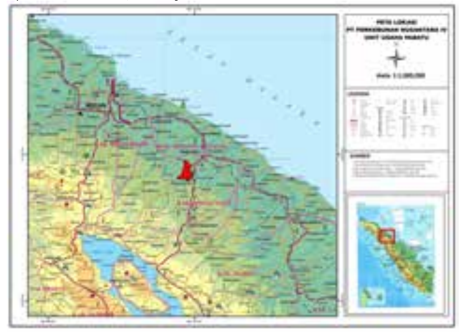
Figure 1. Location Map of PT Perkebunan Nusantara IV, Pabatu Management Unit