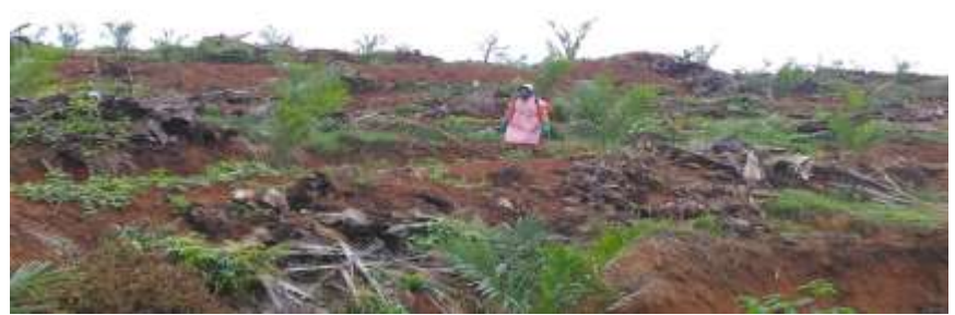
Figure of replanting area block in Block E27, Division 2, Bakau Estate

There is a sample document of working payment in PT Mitra Karya Jaya Perdana in BBE-BAPP 5, No. 152 / HR-PO / BJB / I / 2016 dated January 25, 2016, for Collective Labor Agreement No. 010 / replanting / LMR-BBE / XII / 2014, worth of Rp 1,047,858,500.