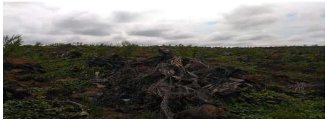
Figure of immature plant acreage in Block C05, Division 1 Bakau Estate

Based on the field visits in Block C05 Division 1, Sungai Cengal Estate known that chopped from the fallen midrib in replanting activities arranged in the inter row into piles.