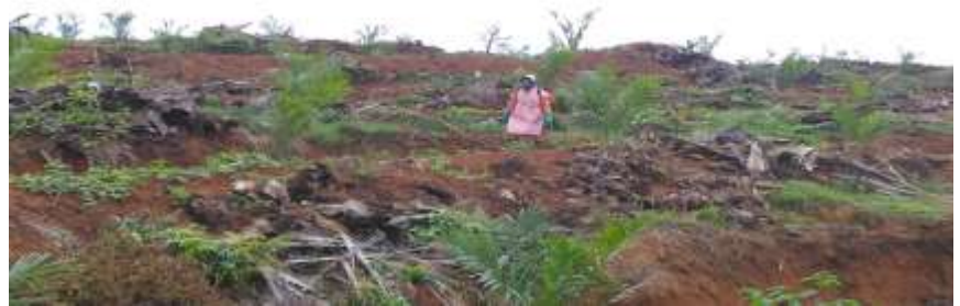
Figure of replanting area block in Block E27, Division 2 of Bakau Estate.

There is a sample document of working payment in PT Mitra Karya Jaya Perdana in BBE-BAPP 5, No. 152 / HR-PO / BJB / I / 2016 dated January 25, 2016, for Collective Labor Agreement No. 010 / replanting / LMR-BBE / XII / 2014, worth of Rp 1,047,858,500.