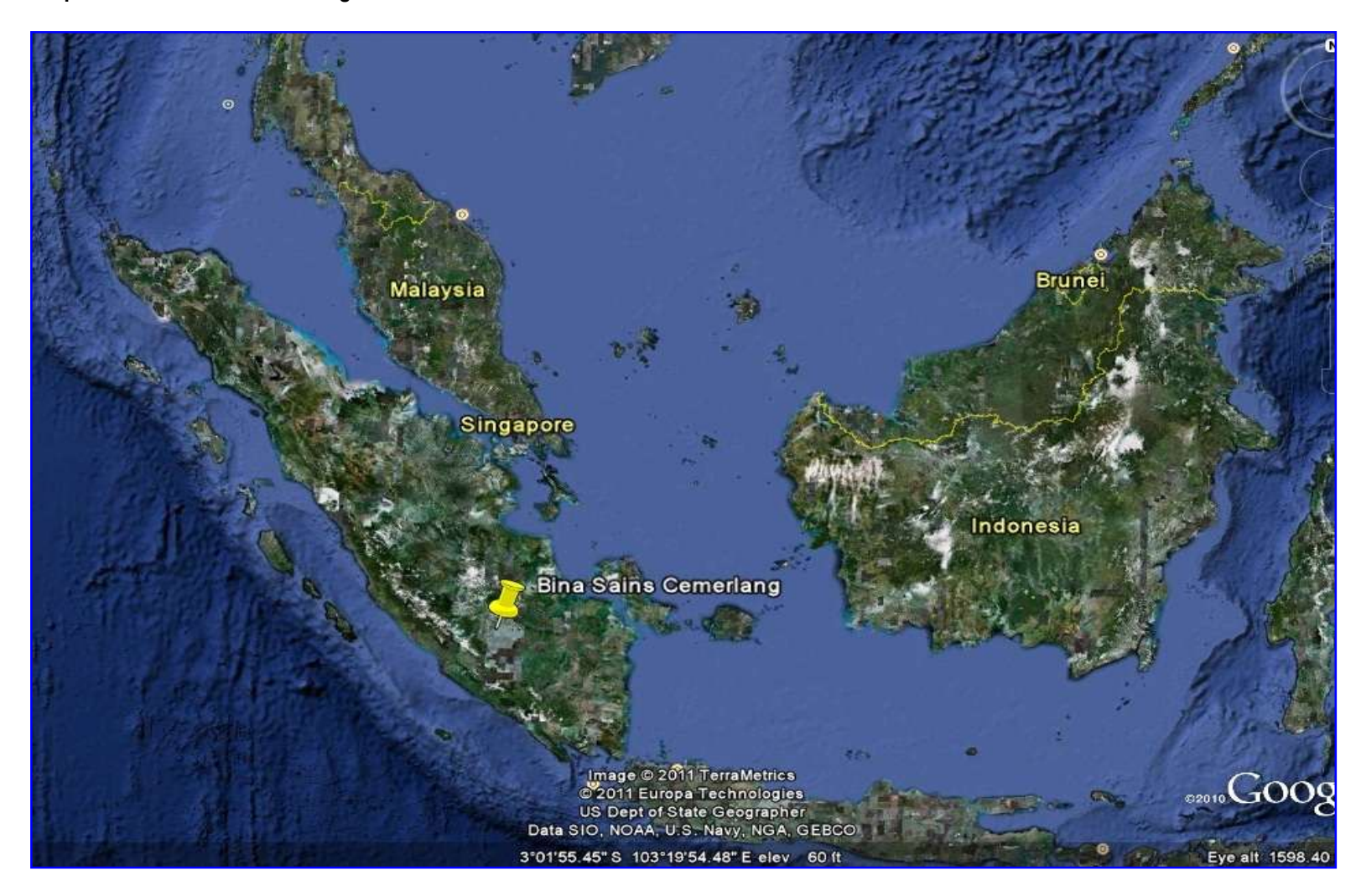
Figure 1. Location Map of PT Bina Sains Cemerlang