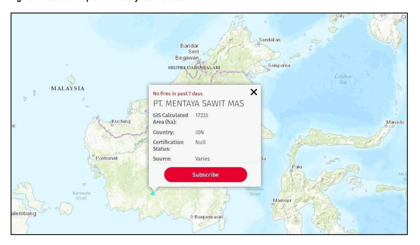
Figure 1. Location Map of PT Mentaya Sawit Mas

SPO – 4006a.7 Page 3 Prepared by Mutuagung Lestari for Mentaya Sawit Mas POM – PT Mentaya Sawit Mas, subsidiary of Wilmar International, Ltd.