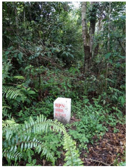
Boundary Poles No. BPN BBB No. 45