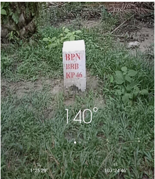
Boundary Poles No. BPN BBB No. 46

Based on field visit and legal boundary observation in Block C10 Afdeling C, C15 and F7 Afdeling Afdeling G found that boundary poles located in the middle of planting area that stated as Production Forest/Conversion Production Forest. However, there is insufficient evidence that the company already has a convincing and well-implemented mechanism for separating certified and non-certified products. Non Conformity No. 2018.1.