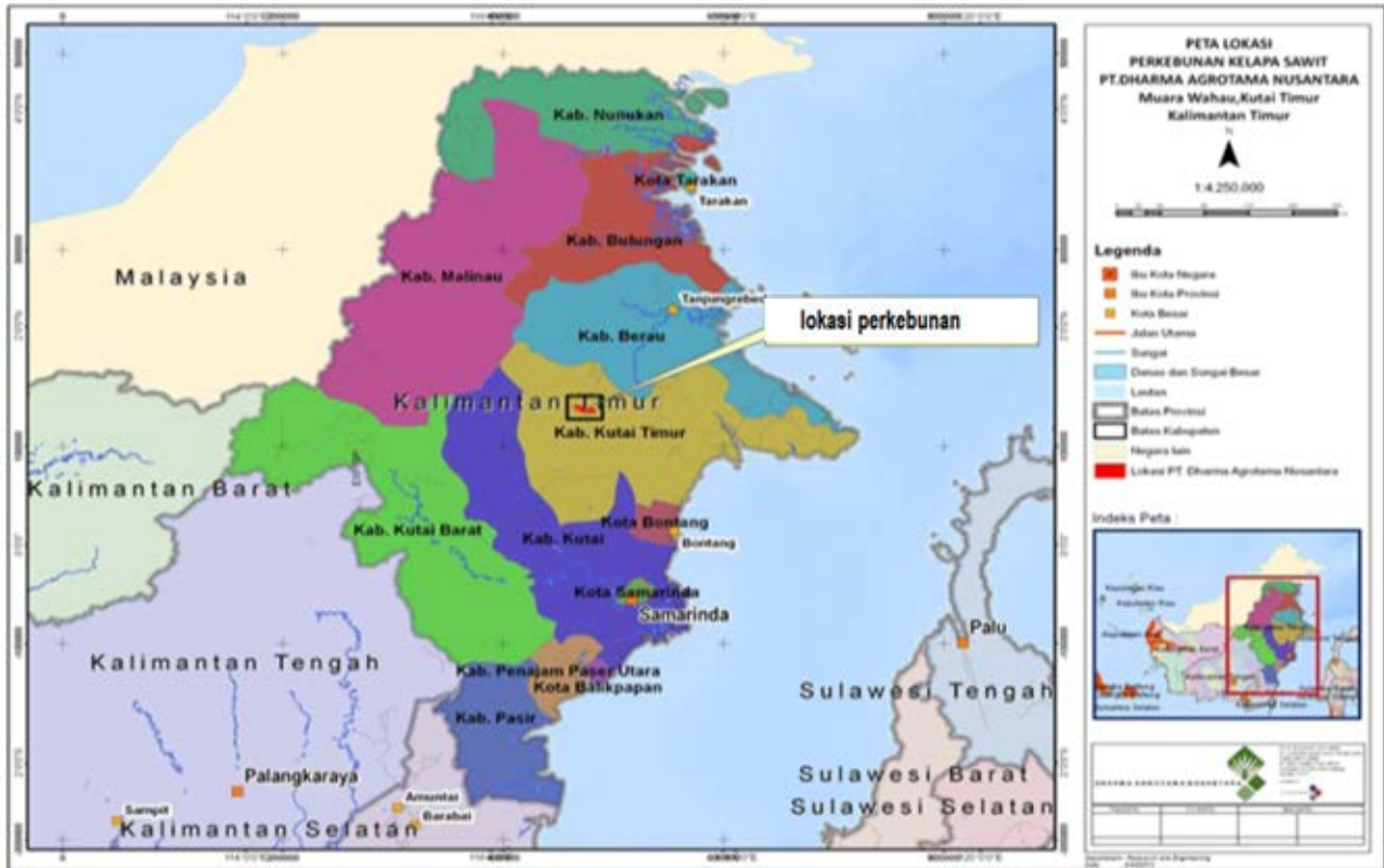
Figure 1. Location Map of PT. Dharma Satya Nusantara