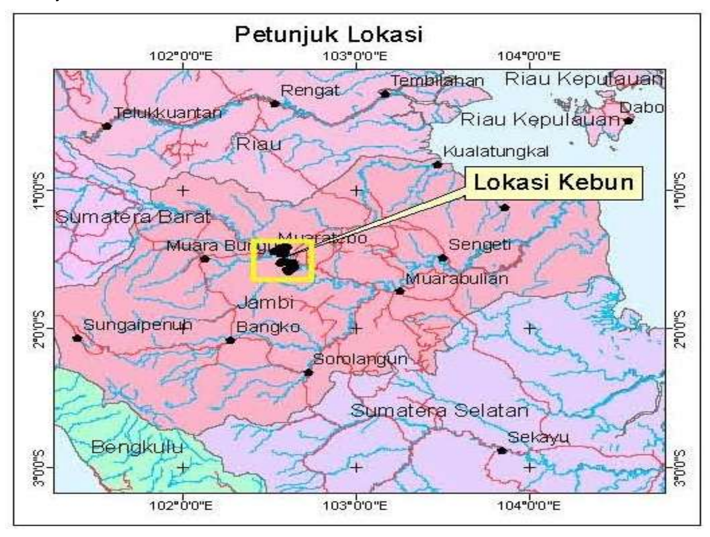
Figure 1. Location Map of PT Satya Kisma Usaha