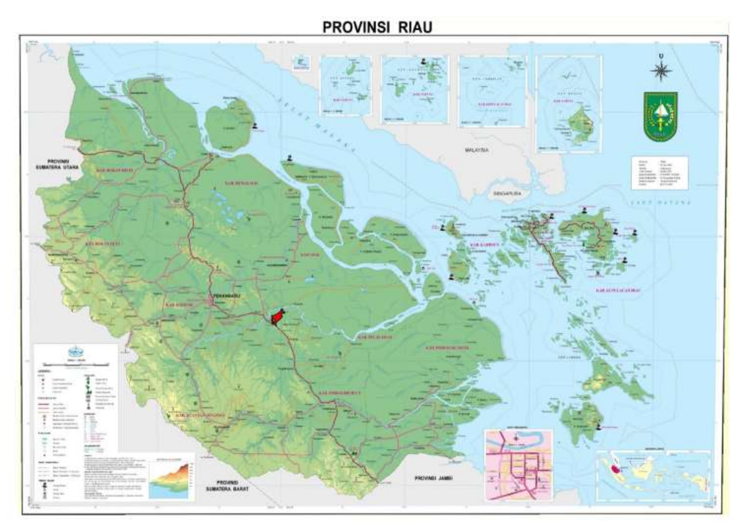
Figure 1. Location Map of PT Adei Plantation & Industry – Nilo POM 1