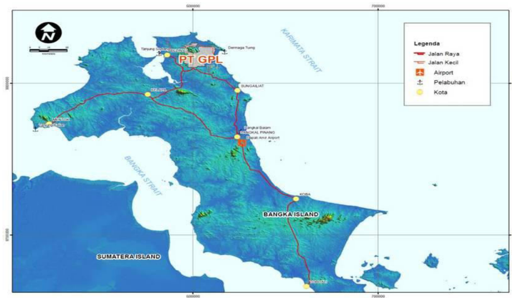
Figure 1. Location Map of PT GUNUNG PELAWAN LESTARI