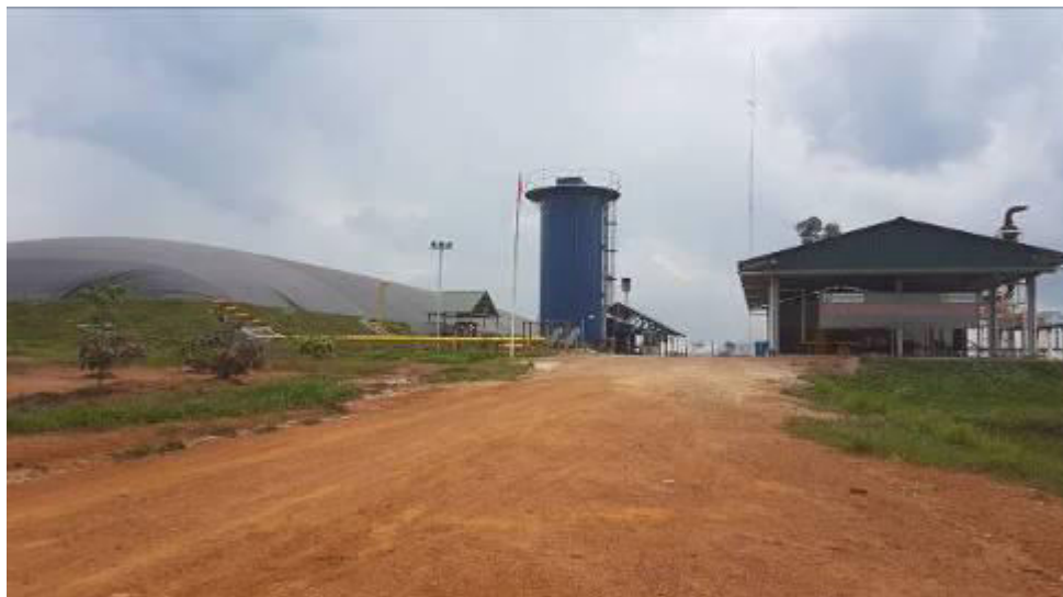
Biogas Plant at Tengkalat Mill

Also, the company has procedure for GHG emission inventory “SOP Inventarisasi dan Mitigasi Emisi GRK (No. Dok: GPL/SOP/Umm-28, Rev. 00; 2 Maret 2016)”. Tengkalat POM has installed Biogas Plant and integrated with Palm Oil Mill since March 2016. This effort as a company commitment to reduce of GHG emission and producing renewable energy.