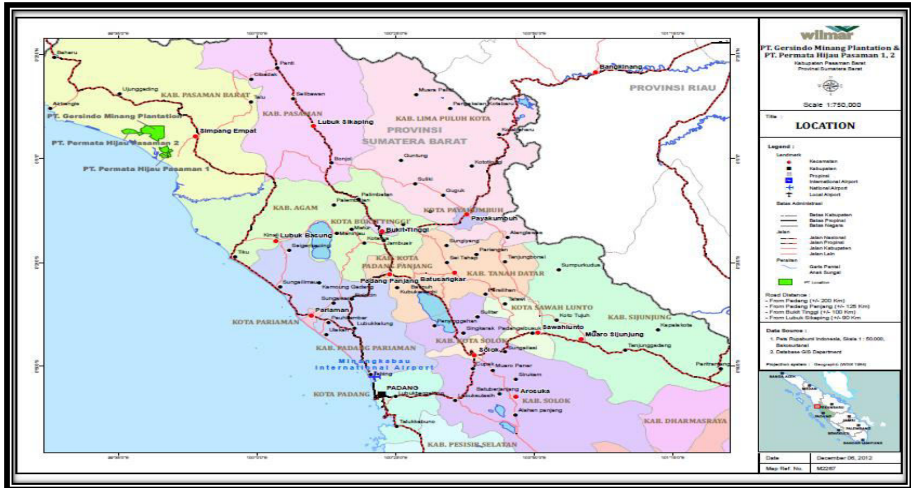
Figure 1. Location Map of PT. GMP - PHP